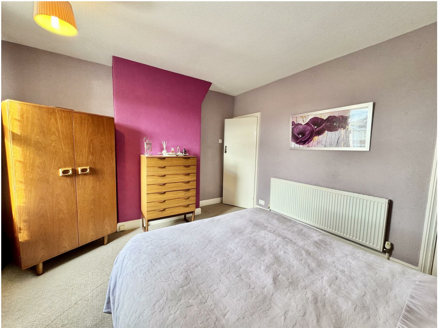
BEDROOM THREE 11'1" x 6'11" max into recess